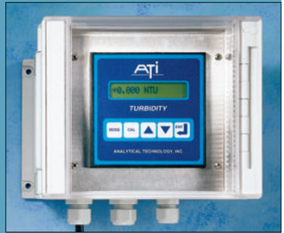
NEMA 4X Monitor

Because turbidity measurement is often required in wastewater effluents and other applications where sensor fouling can be a major problem, ATI offers a special turbidity unit, the D15/76 system, that uses an "air-blast" sensor cleaning system that automatically cleans the sensor as often as necessary to maintain reliable measurements. This system is used only for submersion applications only, and all air supply components required for the cleaning process are supplied in the NEMA 4X monitor package.