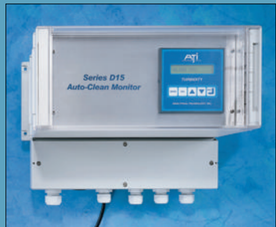
Auto-Clean Turbidity Monitor