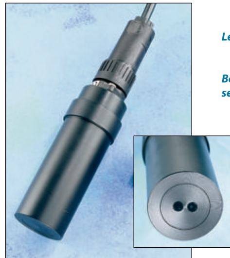
Left: Turbidity Sensor